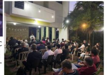
Below: Vespers with attendees of the 4th annual FPH conference for the DR seminary’s online distance students.