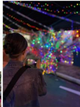
I love that Christmas in LAC (décor, music, etc.) tends to run through the ACTUAL 12 days of Christmas. Above photo: Snapping a pic of a Christmas peacock (?) in December 2025.