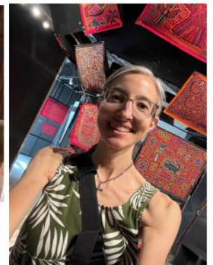
I finally made it to Panama City's Mola Museum .